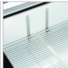
Adjustable false base